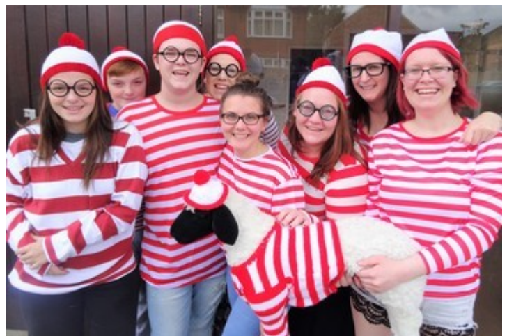
Bristol District Youth Committee in Fancy Dress for the event